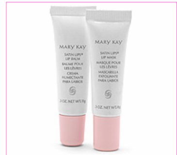
Satin Lips® Set $19 Buff away dry skin with the Lip Mask, then moisturize with Lip Balm, to keep lips soft and kissable.