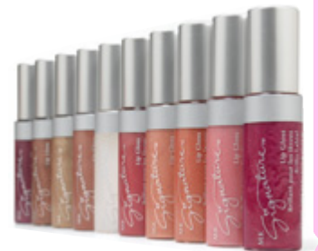
GLOSS & GO $14 Lightweight formula lip gloss combines a sparkling color while hydrating and protecting lips by providing a moisture barrier.