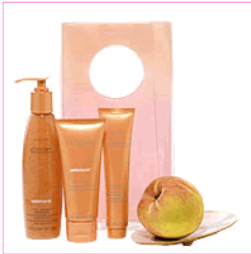
Satin Hands Pampering Set $32 Indulge yourself or someone else with this super-softening treat for hands (and feet too!).