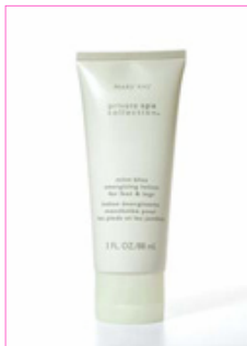
Energizing Foot & Leg Treatment $11 Energize & revive tired feet, legs & muscles with this light fast absorbing menthol formula after a long day on your feet.