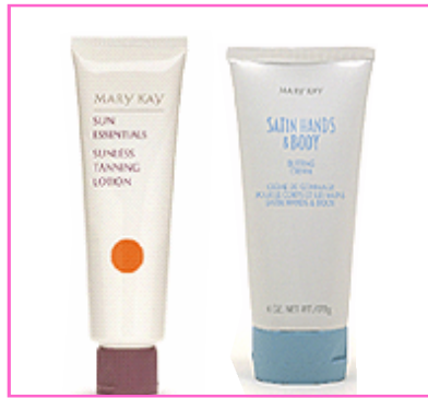
Healthy Tan Set $21 For smooth skin, and a healthy, golden tan! Sunless Tan $10; Body Buffing Cream $10