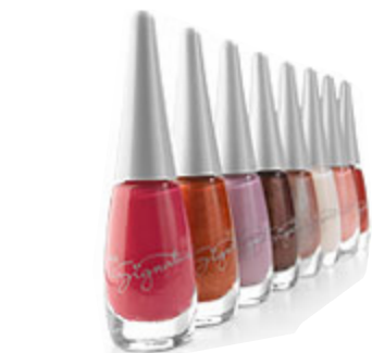
New! MK Signature Nail Enamel $7 Totally new! Totally Wow! This is an advanced long-wearing formula with a high-gloss finish!