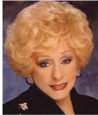
Mary Kay Ash

At 20 years —The skin on the face is still free of wrinkles.